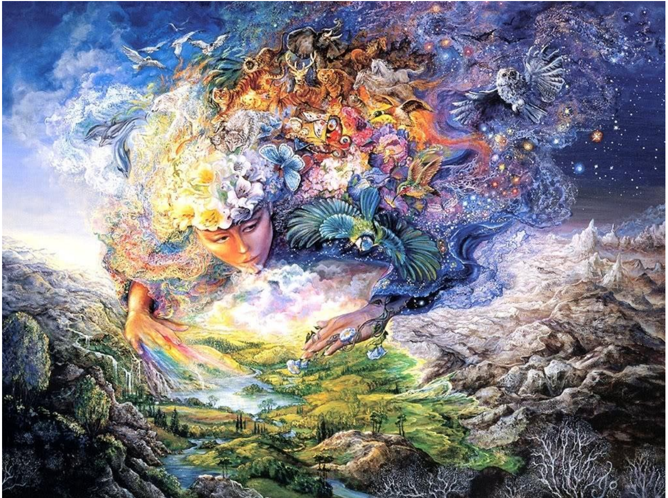
SEASON OF PENTACOST